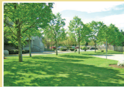
The recreational grounds offer a wide open space for entertaining.