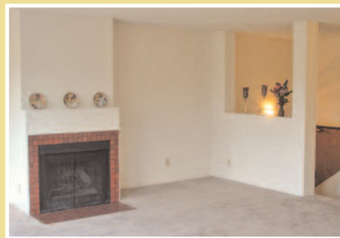
Each of our homes has its own wood-burning fireplace with tiled hearth.