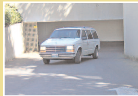
Large, covered, gated parking spaces with convenient access to townhomes.